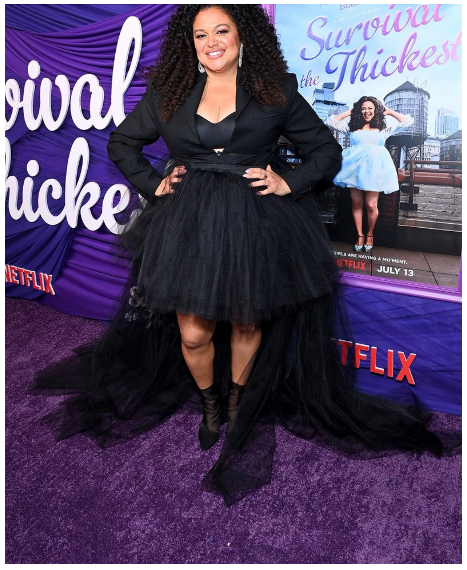
Michelle Buteau attends the Netflix New York Special Screening of Survival Of The Thickest at Metrograph.