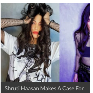
Edgy Fashion. See The Diva Pulling Off The Bold Looks