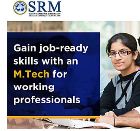
MTech in Data Science from SRM