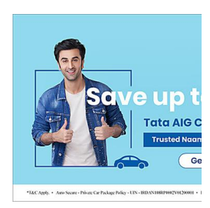
Save up to 80%* on Car Insurance www.tataaig.com