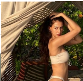
Sexy Beige Bikini, Check