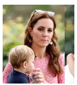
[Pics] Photos Show The Differ Meghan & Kate's Parenting ArticleSkill