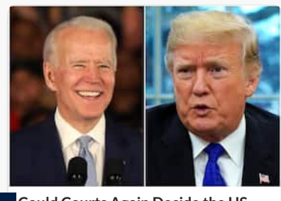
Could Courts Again Decide the US Election? Legal Showdown Likely as Race for White House Hots Up

Democrats and Republicans girded Wednesday for a legal showdown to decide the winner of the tight presidential race between Republican Donald Trump and Democrat Joe Biden.