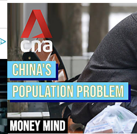
Demographic Timebomb: How W Ageing Population Impact Asia? Mind