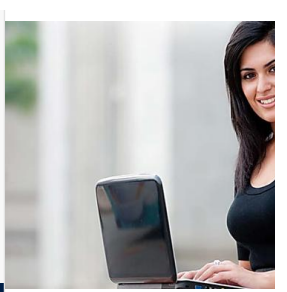
48% plus salary hike after our PG