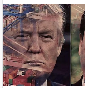
US-China relations: Does it signa of a new Cold War?