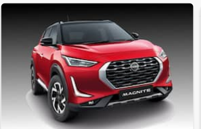
Upcoming Nissan Magnite Compact SUV Prices Leaked Ahead of Launch in India

Prices for the Nissan's upcoming new Sports Utility Vehicle (SUV) the Magnite, which was unveiled In October this year was recently leaked online. Nissan India, which is the subsidiary of the Japanese