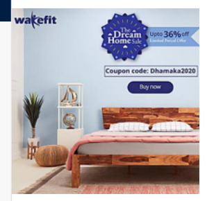
Elegant Designed Wooden Bed C Without Storage at Best Price. D