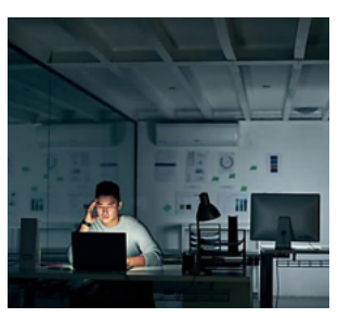
Singapore is 'most fatigued' countr world – and we're tired of it CNA Lifestyle