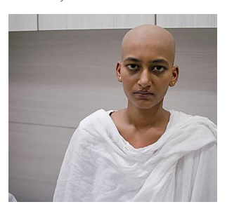
With Your Support, I'll Be Able To G My Children. Donate Ketto