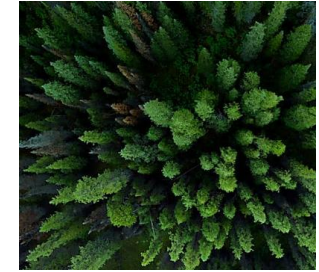
Taking Action on Climate Change