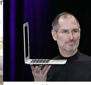
Top 10 Mac Antivirus - Do Mac User Need Protection?